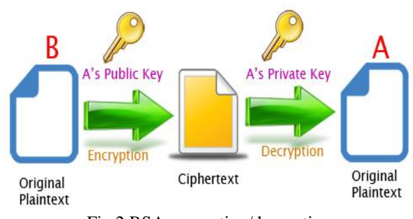
Fig.2 RSA encryption/decryption

The all parts of file so data get decrypted and downloaded that ensures the tremendous quantity of security to cloud information.