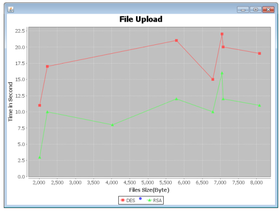
Fig 3 Results Encryption/Decryption Algorithms.

Uploading and Encrypting Data Using RSA and DES Algorithm. Result are as below